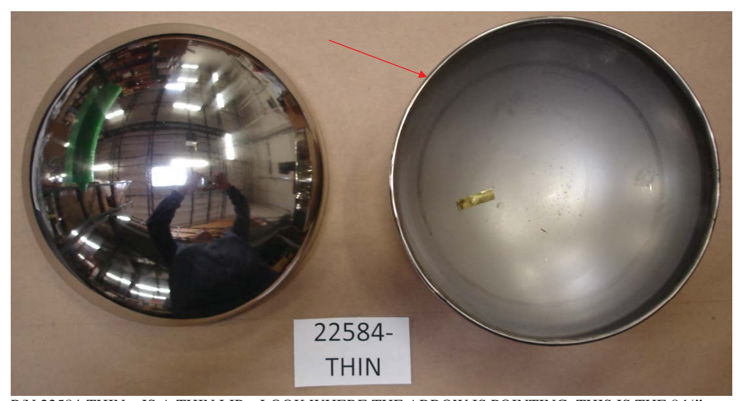
P/N 22584-THIN – IS A THIN LIP – LOOK WHERE THE ARROW IS POINTING. THIS IS THE 8 1/4"