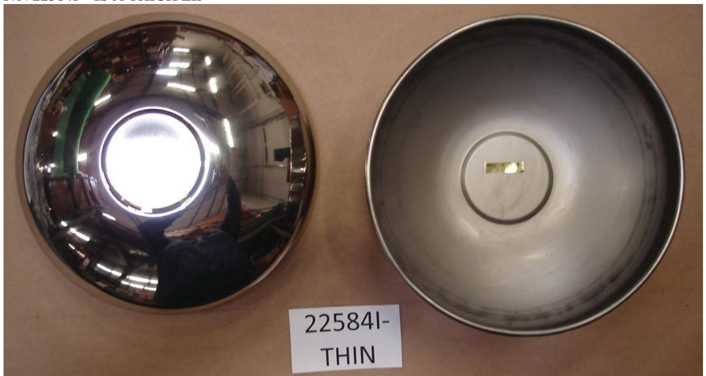
P/N 22584I-THIN – IS A THIN LIP

BELOW YOU WILL SEE PICTURES OF WHAT THEY WOULD BE INSTALLED ON AND HOW THEY ARE INSTALLED.