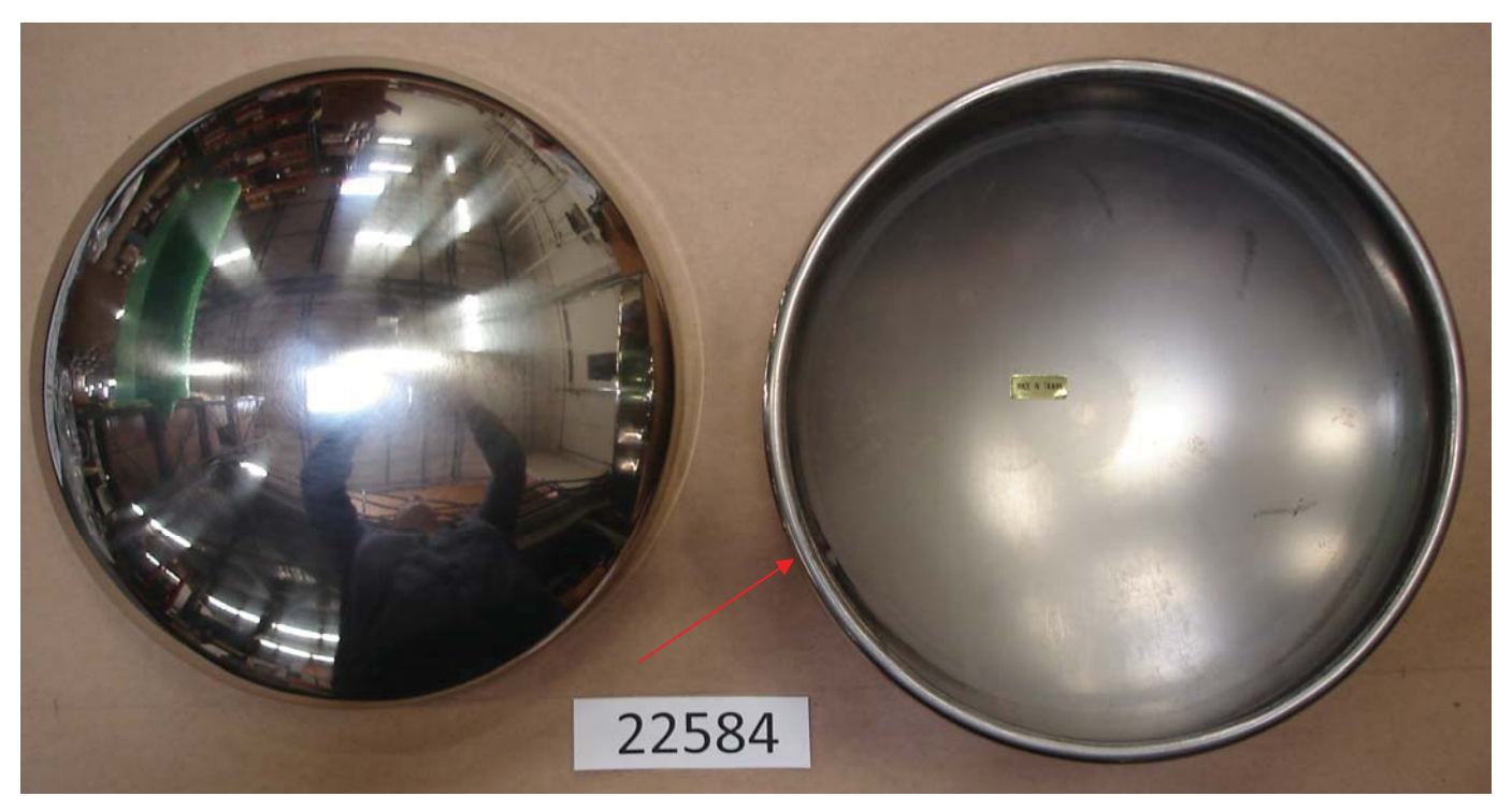
P/N 22584 – IS A THICK LIP – LOOK WHERE THE ARROW IS POINTING. THIS IS THE 8"