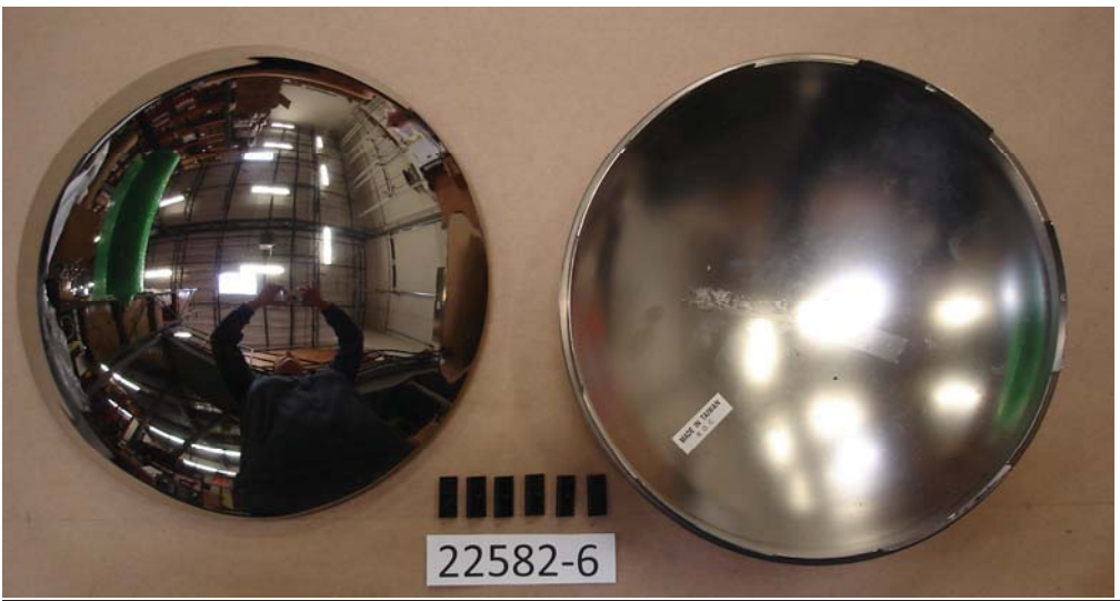
P/N 22582-6 – has 6 Notches