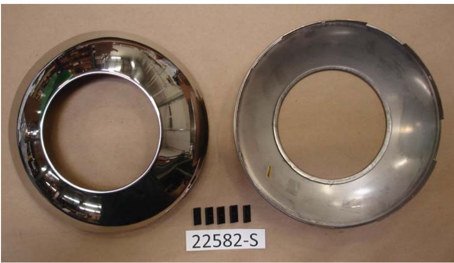
P/N 22582-S – has 5 Notches –