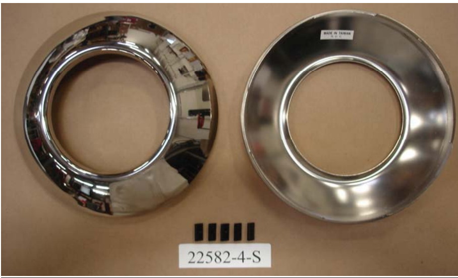
P/N 22582-4-S – 4 has notches